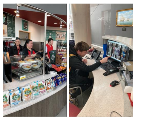
Learners from Coleg Gwent who have been at USW Newport campus on an enhanced placement.

Progression and Collaboration at Post-16 (2023 Update)