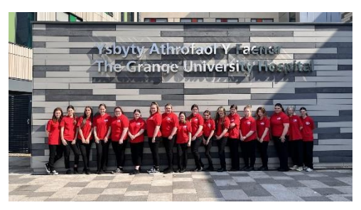
RCN Cadets at The Grange Hospital on their first day